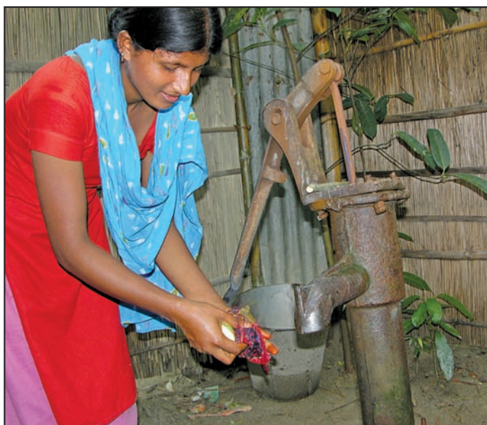
A cloth-washing-with-soap demonstration is part of the training module

But persuading people to build latrines in Char Bramagacha is difficult. It is in an area which floods heavily every year when the rivers rise throughout Bangladesh. The village becomes an island only accessible by boat, or by wading through deep water. 'Last year all the houses were six feet under water for 14 days,' says the Union (local council) Chairman, Mr Anisur Rahman. 'Many houses used to have latrines, but the flood damaged them. This is what led to our low level of sanitation.' To spend scarce money on building a proper toilet when it may easily be washed away is not a popular idea. Yet Amina persists and is currently lobbying the council to use 20 per cent of a government development grant on improved sanitation.